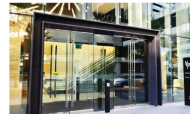
- UPTOWN -