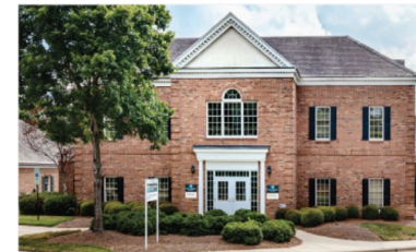
- PINEVILLE -