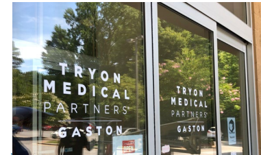
- GASTON -