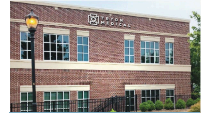
- HUNTERSVILLE -