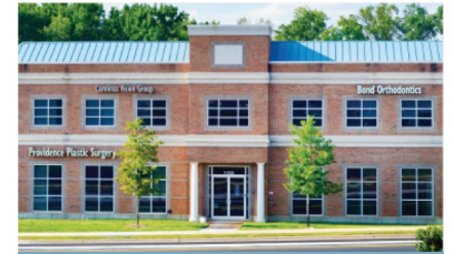
- WAVERLY -