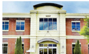
- STEELE CREEK -