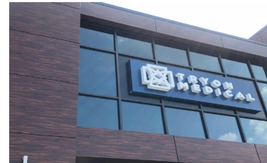
- MATTHEWS -