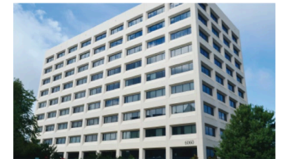
- SOUTHPARK -